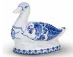
096450 3" $179.95