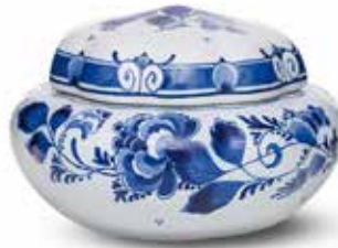
091017 6.25" Covered Dish $319.00