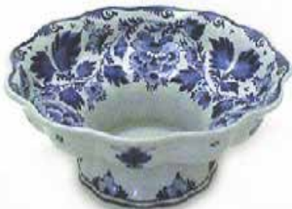
091032 9" dia. Fluted Foot $559.95