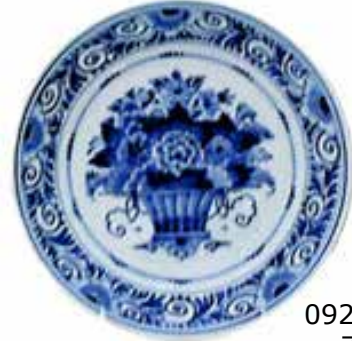
092204 7" $220.00