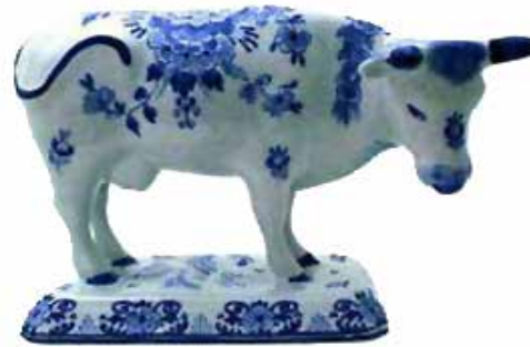
091071 6" $598.97