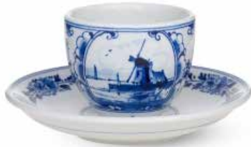
091128 3" Cup & Saucer $254.95