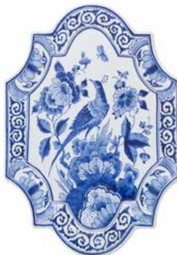
092119 12" x 9" Vertical Plaque $405.95