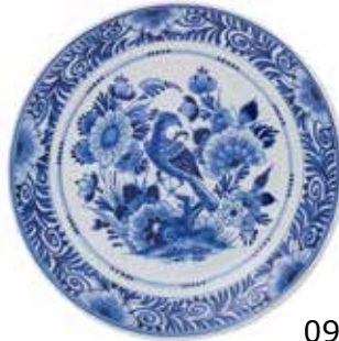
092007 7" $239.95