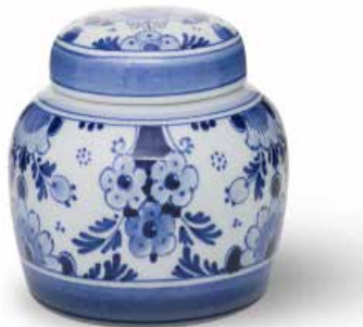
091083 3" Ginger Jar $215.00