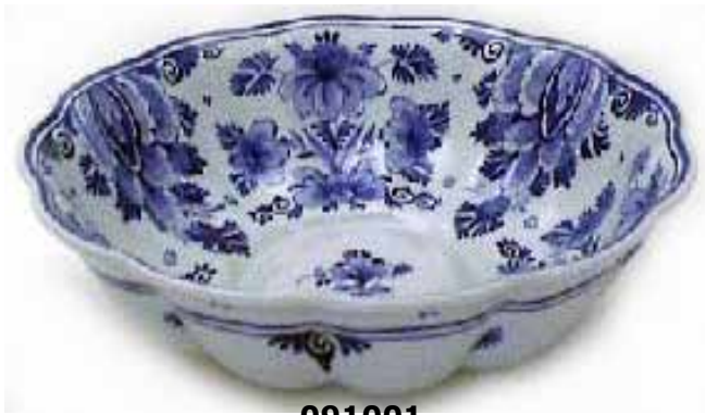
091001 10.75" dia. $595.00