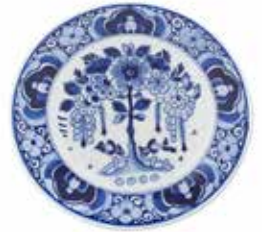
092068 5.5" $159.95 Tree of Life