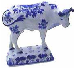
091068 4" $350.00