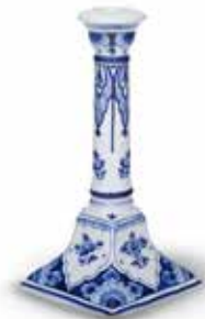
091085 7.25" Candleholder $269.95