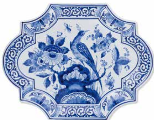
092016 9"x 12" Horizontal Plaque $410.00