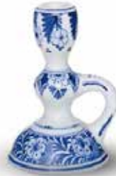
091021 4" Candleholder $179.95