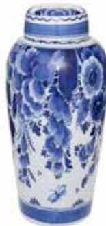
094001 8" $425.95