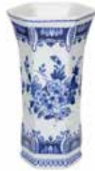
093040 7" $374.95