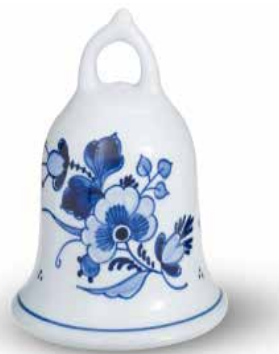
096412 3.25" Bell $89.95