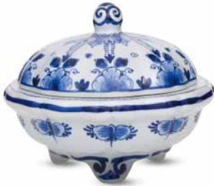
091010 5.5" Footed Covered Dish $350.00