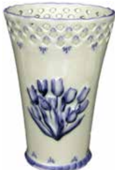
038071 6" H $23.95