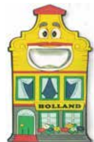
276006 Bottle Opener 2" x 5.5" $5.95

This retail Wooden Items Catalog is available for viewing or printing, directly from the web as a pdf at bluedelft.com or at shopping.dutchvillage.com . Prices are subject to change without notice. © Nelis' Dutch Village