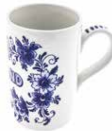
294416 "I Love Holland" Mug 4" H $5.95