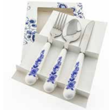
294807 Cutlery Set 8.25" L $16.95