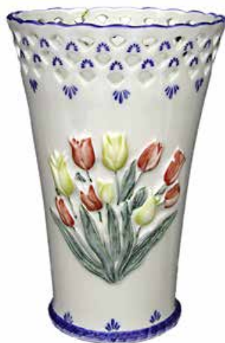
038077 7" H $29.95