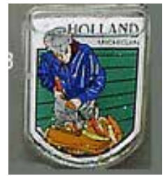
407933 acrylic clip magnet 2.5" $1.00