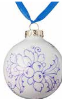
297581 2.5" DIY Ball Ornament $9.95