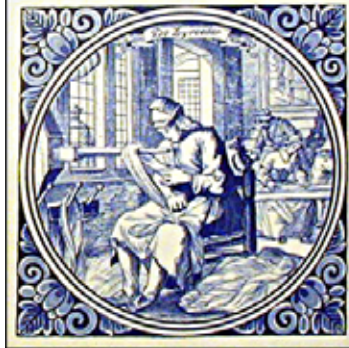
131255 - SILK SPOOLER