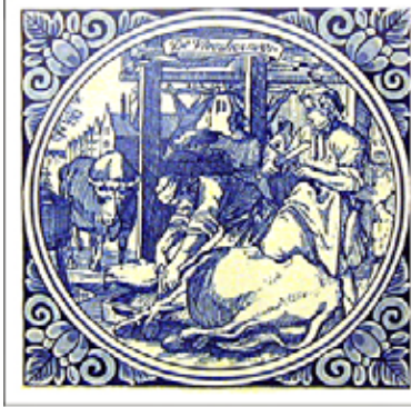
131266 - BUTCHER