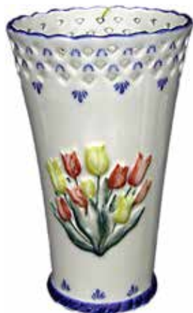
038076 6" H $23.95