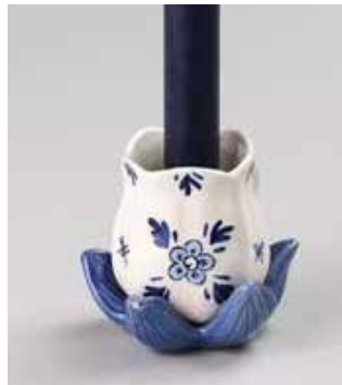
6530551 2.75" H $5.95 (Candle not included)