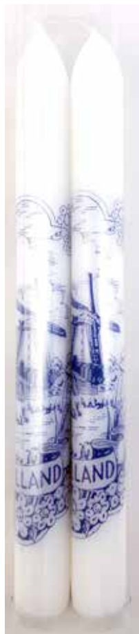
279037 10" H $4.95 2 Pack