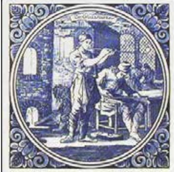
131253 - GLASSBLOWER