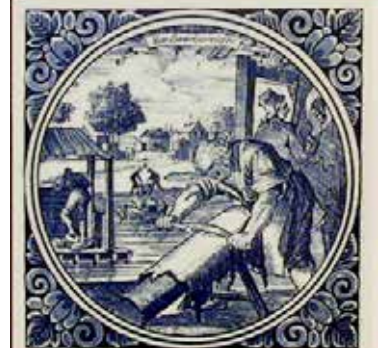
131258 - LEATHER TANNER