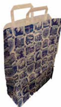
079110 Paper Shopping Bag $2.00