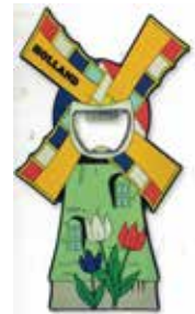
276005 Bottle Opener 3.25" x 5" $5.95