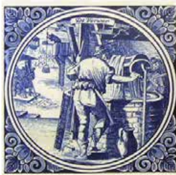
131250 - LAUNDERER