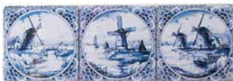
291720 Set of 6 Coasters - 4" x 4" ea. $6.95