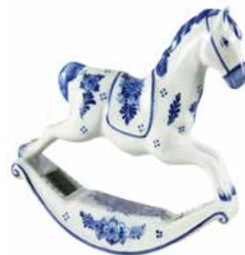
297050 7" L x 6" H $24.95