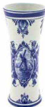
291056 5" $14.95