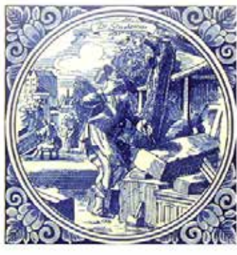
131281 - STONE CUTTER