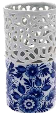
297270 6" h $39.95